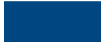
700 DEEP BLUE**