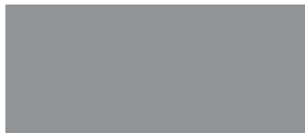
150 DARK GRAY