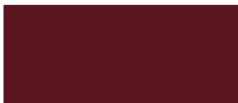
900 BRICK RED